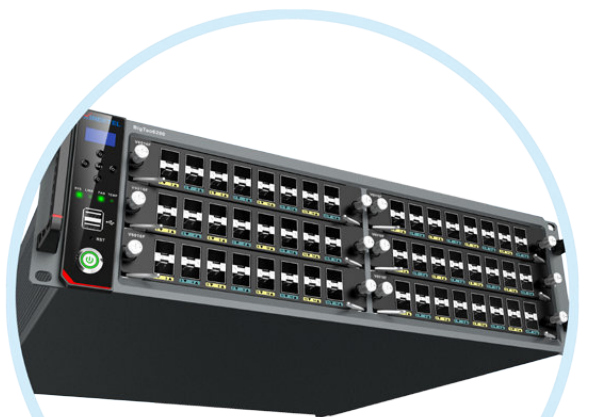
High port density